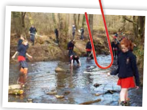
Year 6 Geography field trip to Symonds Yat and Cannop Ponds