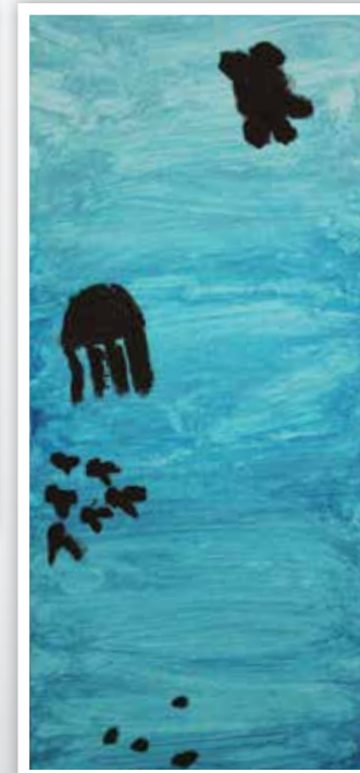
Tonal ocean study with acrylic silhouettes Sophie B