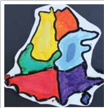
Emily Garfield-inspired map, Jack F