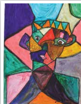
Picasso-inspired study in acrylic and ink, Eddie S