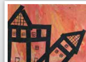
Great Fire of London scene, Heath G