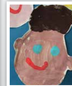
Self-portrait, Dylan B