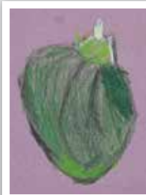
Pencil and oil pastel fruit, Hermione H