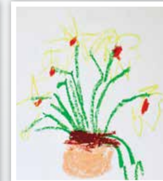
Flowers in oil pastel, Florence D