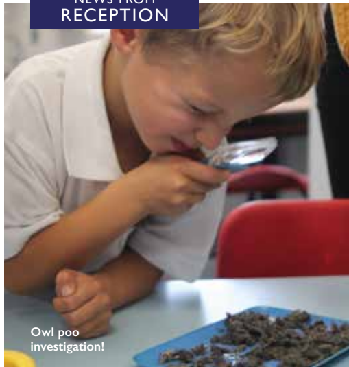
Owl poo investigation!