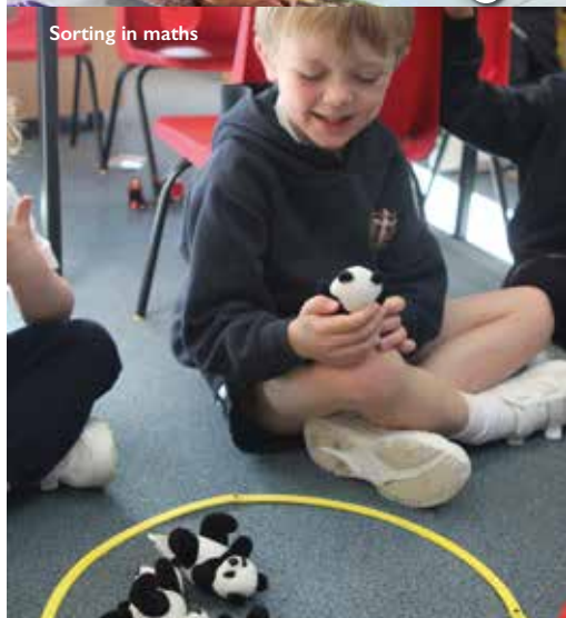
Sorting in maths