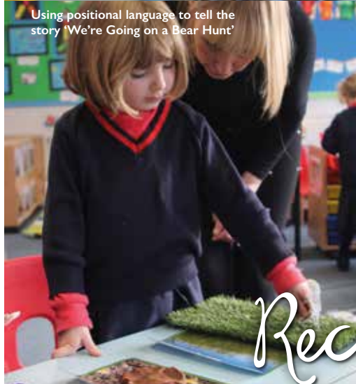
Using positional language to tell the story 'We're Going on a Bear Hunt'